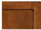
CHOCOLATE GLAZE* 28CSC