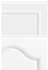
WHITE I5W/ Q5W